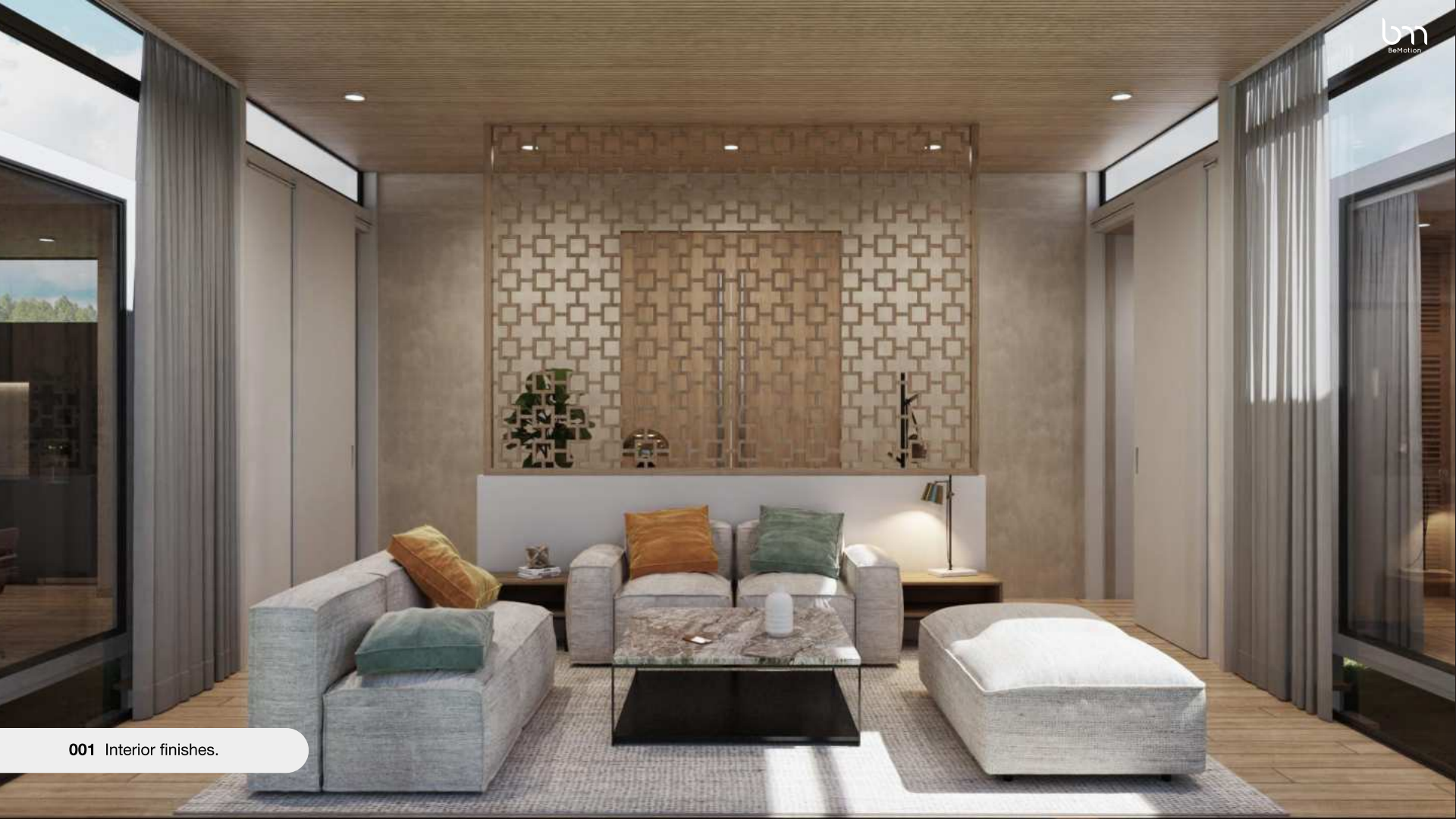
001 Interior finishes.