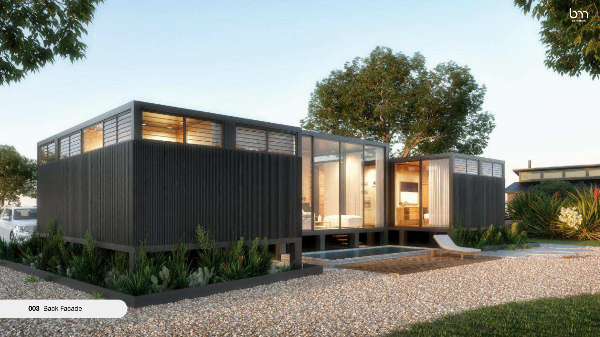
003 Back Facade