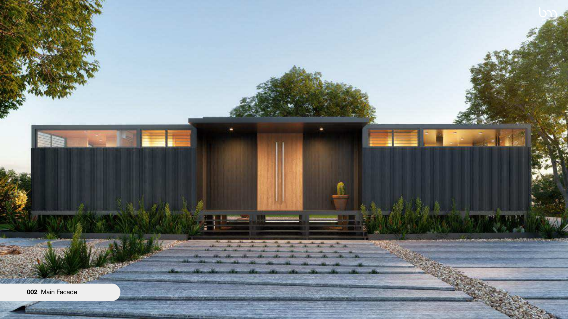
002 Main Facade