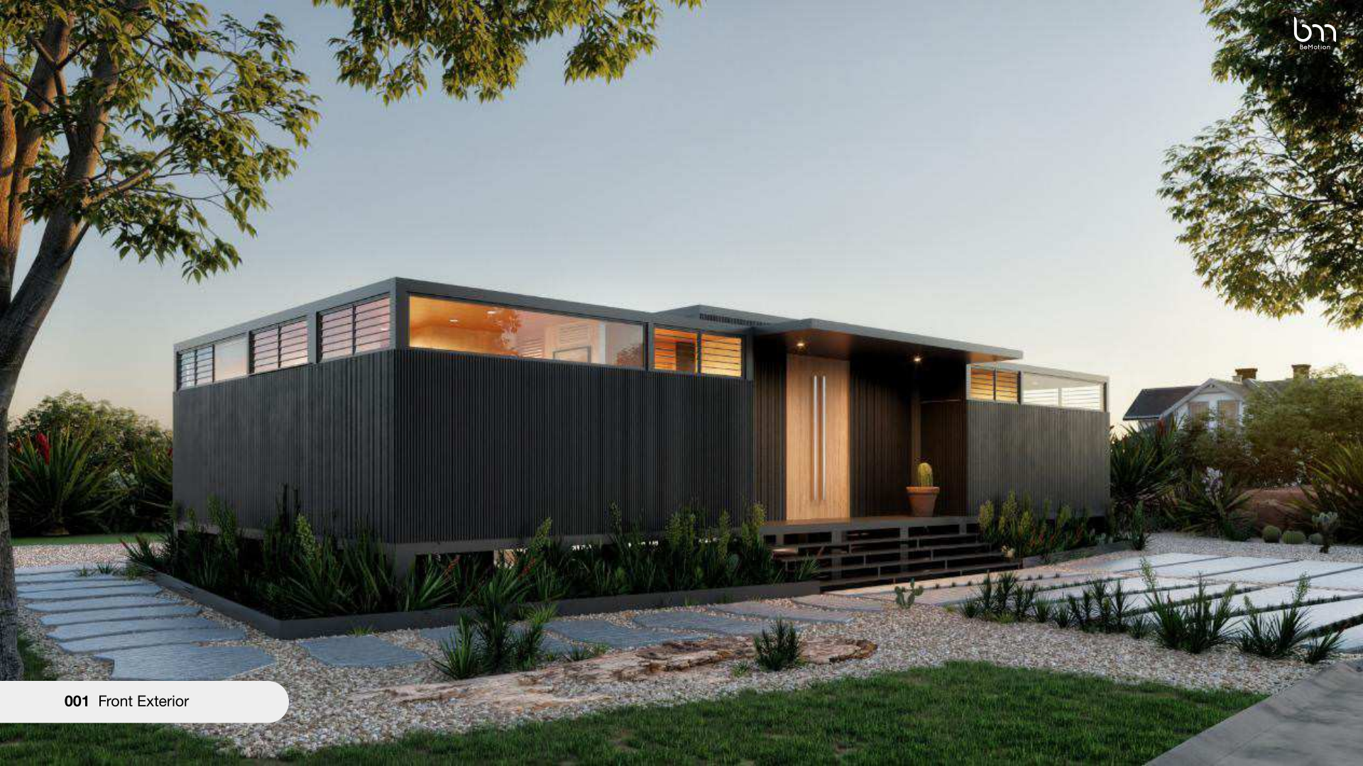
001 Front Exterior